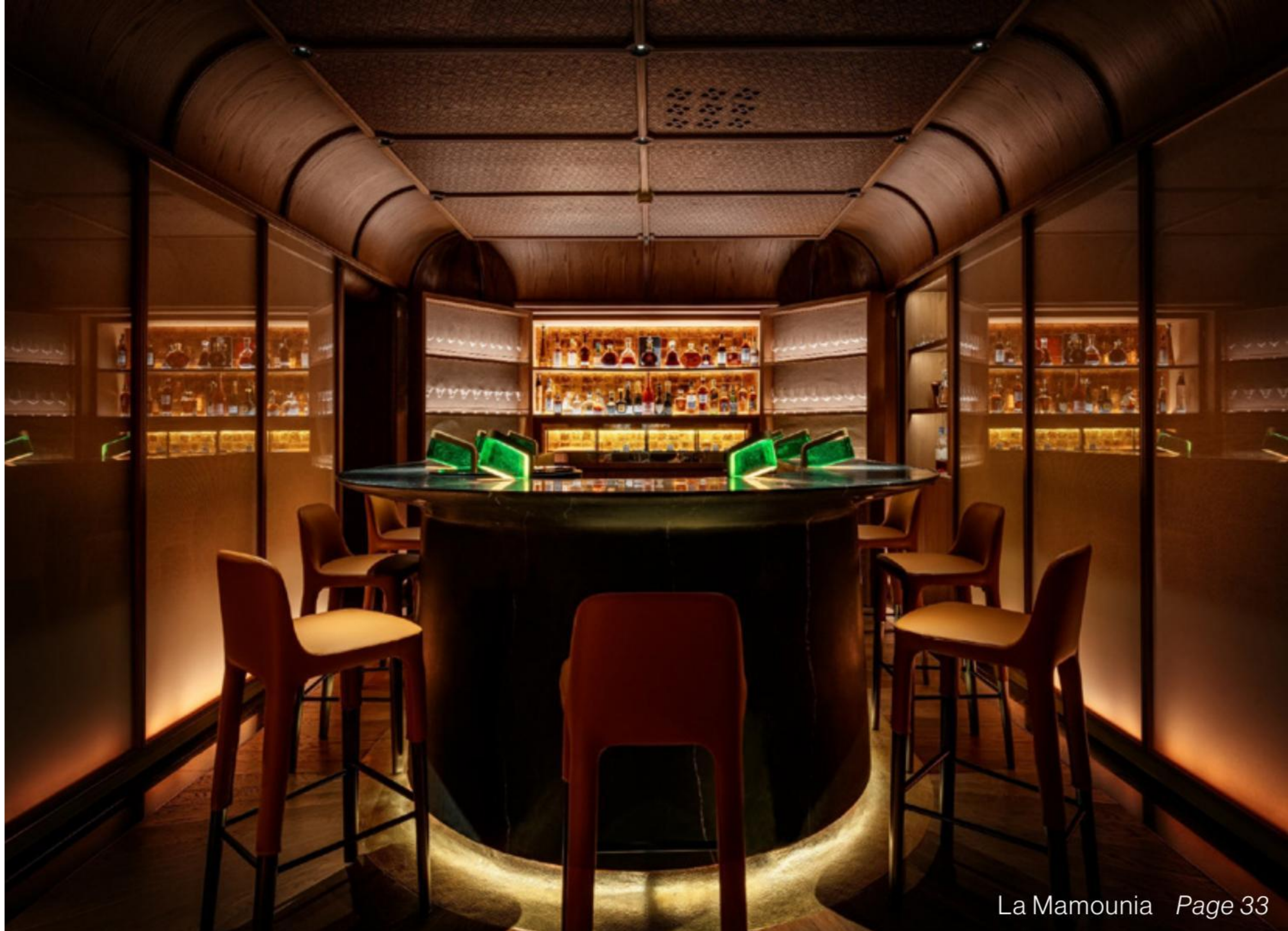
La Mamounia Page 33